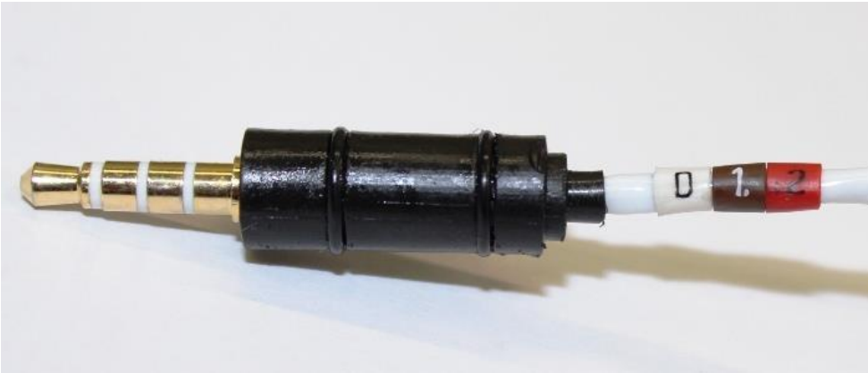
Fig. 3 Series D, year 2012 (marked on cutting unit cable)