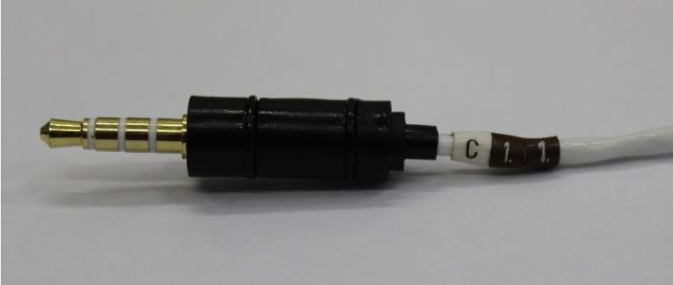
Fig. 2 Series C, year 2011 (marked on cutting unit cable)