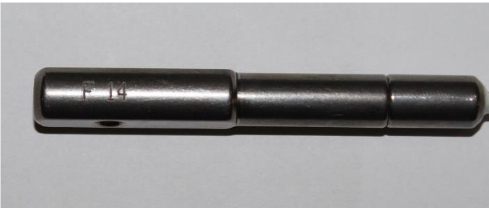
Fig. 4 Series F, year 2014 (marked on cutting unit cable)