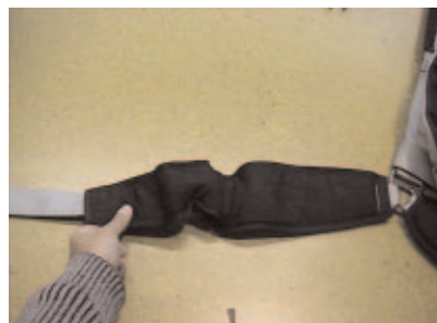
7. Pull Leg Pad back