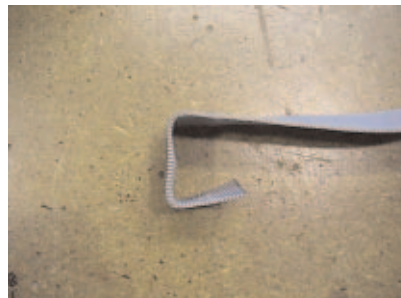
5. Unpick Leg Strap Turned End.