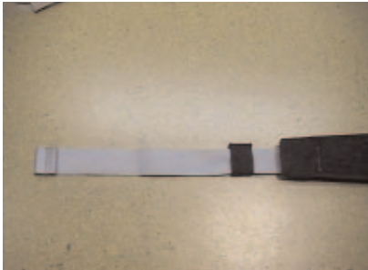
2. Leg Strap TYPE 7 Webbing.