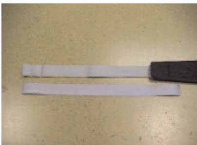
6. Cut a piece of TYPE 12 Webbing as shown. Cut the Webbing 6" longer than Leg Pad overlap.