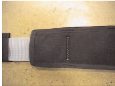
3. Unpick Zig-Zag on Leg Pad.