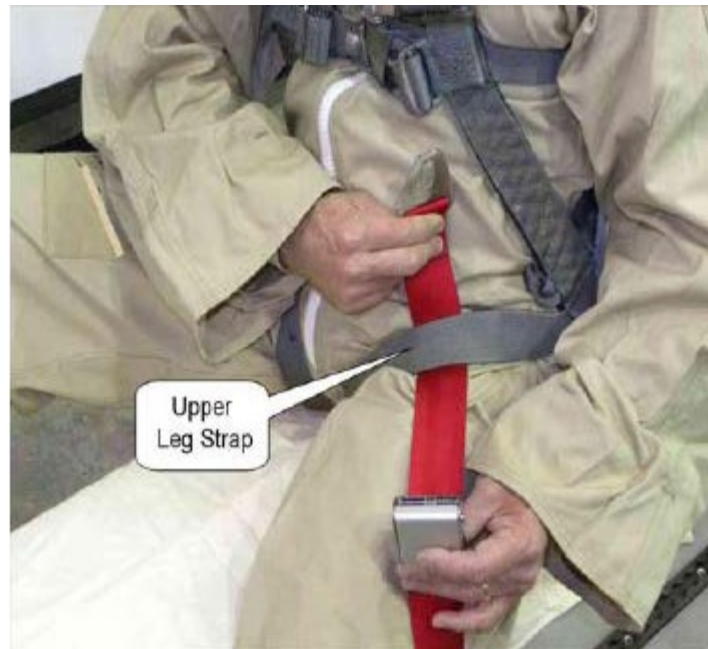
FIGURE 5. PASS TETHER LOOP UNDER MAIN LIFT WEB