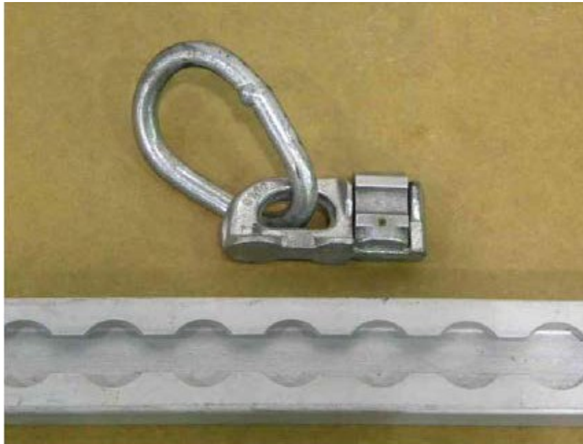
FIGURE 3. TETHER RESTRAINT USAGE